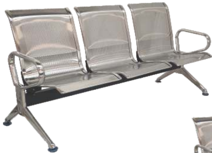
■ SS-3 Seater