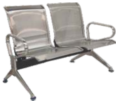
■ SS-2 Seater