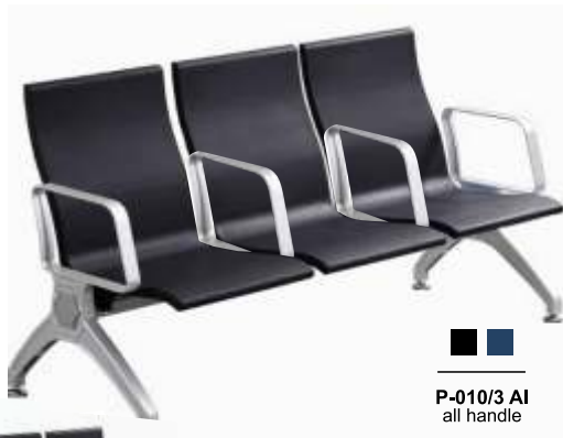
P-010/3 AI all handle